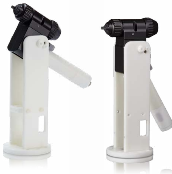
Rear Manifold Gun with robot mount

Gun Models include air cap part number 24N477 and 1.5 mm (0.055 in) nozzle part number 24N616