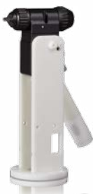
Solid Wrist Bottom Manifold