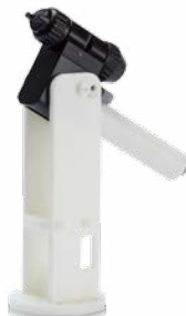
Solid Wrist Rear Manifold